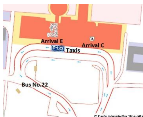
Bus (22; 322; 241) and taxi stops at the airport

http://saraksti.rigassatiksmelv/index.html#bus/22/b-a/en